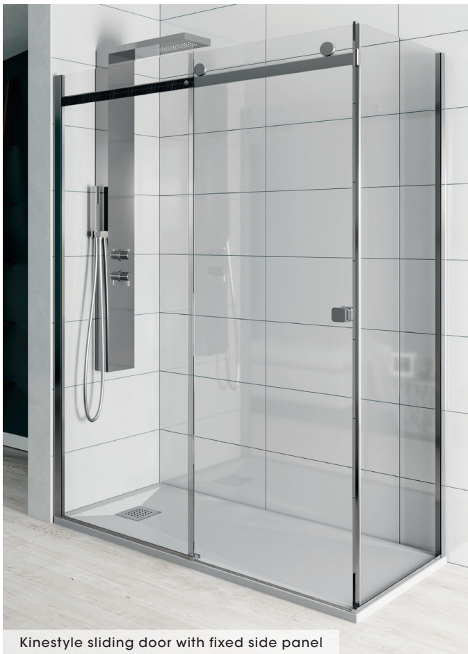
Kinestyle sliding door with fixed side panel