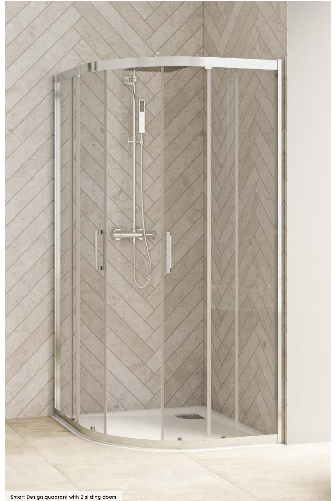
Smart Design quadrant with 2 sliding doors