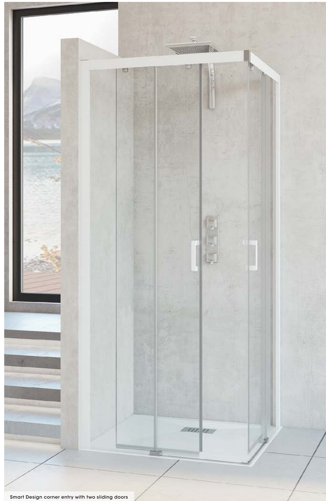
Smart Design corner entry with two sliding doors