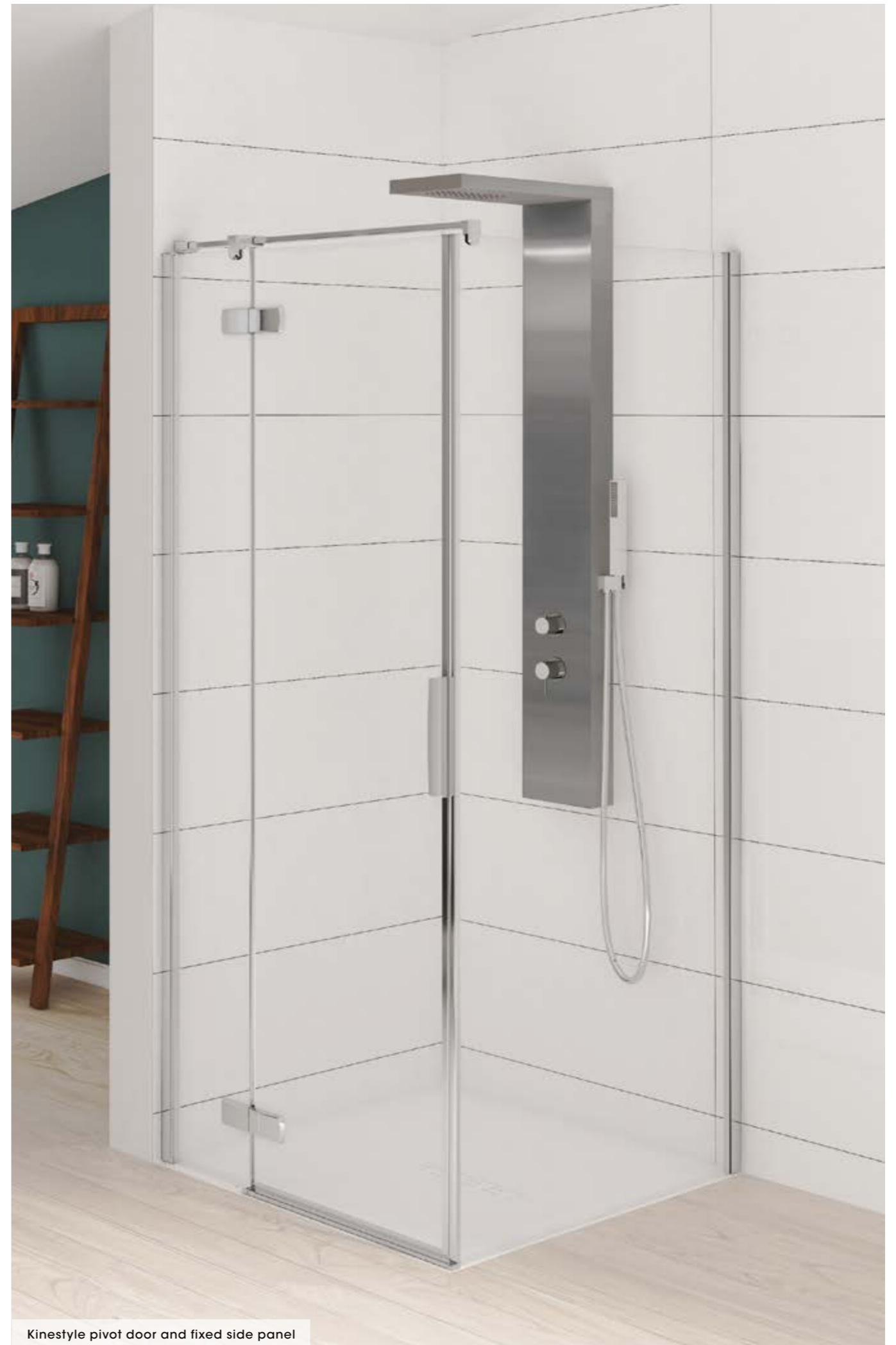
Kinestyle pivot door and fixed side panel